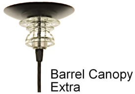
Barrel Canopy Extra

INSULATORLIGHTS Reclaimed Re-purposed www.insulatorlights.com 5 3 0 / 7 7 4 - 5 8 8 0