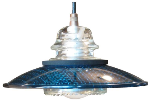
8" trafficlight lens - Go Green Stop Red Caution Yellow

Comes with grounded fixture per NEC standards, ready to hang with glass insulator, 5' round 3 wire cord black, 130v 40w incandescent reflector bulb, black ceiling canopy kit, hardware & instructions. Insulators are cleaned, polished, drilled, fixtured and ready to use. 8" diameter plastic Trafficlight comes in Go Green, Caution Yellow & Stop Red